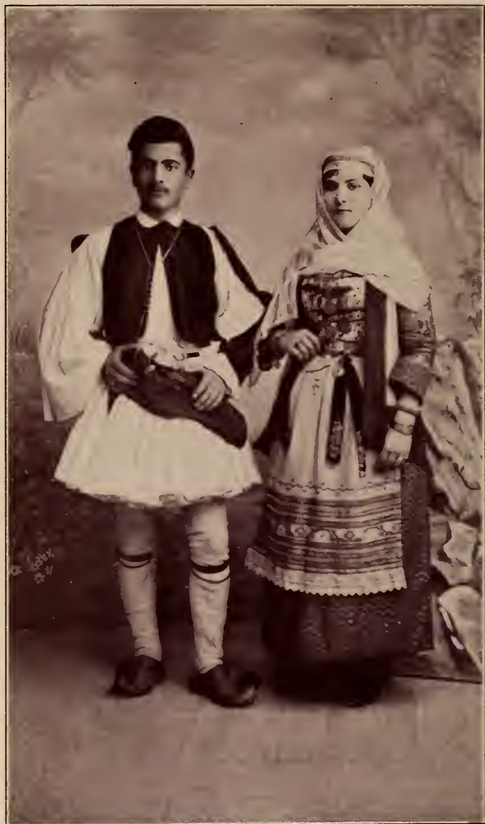
GREEK BRIDE AND BRIDEGROOM